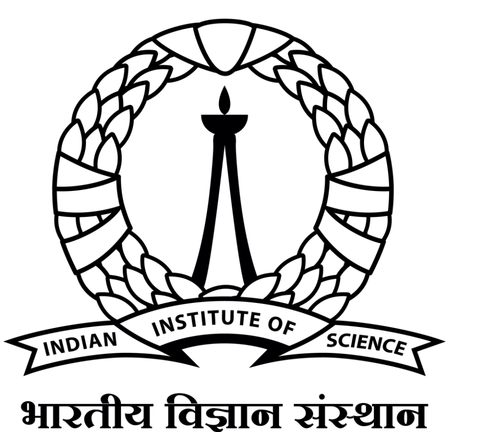
Figure 2 A & B Comparison of Overpotentials, C) Gas Fraction Distribution in ZGAWE D) Hydrogen Quantification